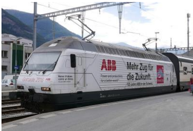
ABB is one of the world's leading engineering companies and is a global leader in power and automation technologies. Based in Zurich, Switzerland, the company employs 150,000 people and operates in 100 countries.

Although its current incarnation began in 1988, the company's history encompasses more than 120 years of innovation and technological leadership.